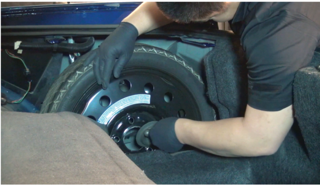
13) Reinstall the spare tire, then reinstall the spare tire retainer hook.