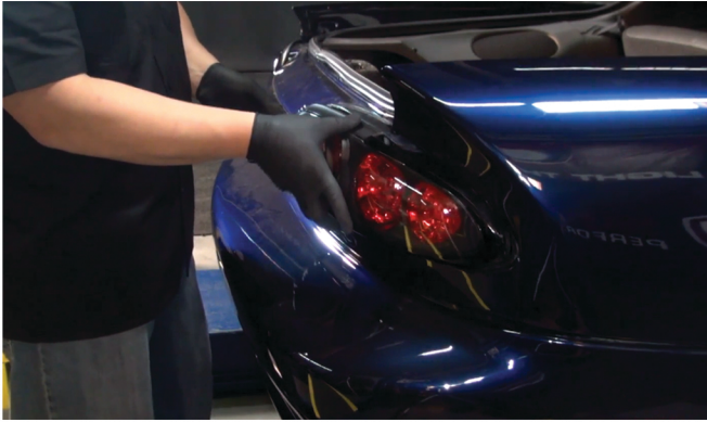
11) Seat the Spyder tail light.