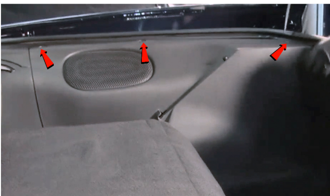
3) Unlock [3x] Flathead retainers securing the spare tire cover panel.