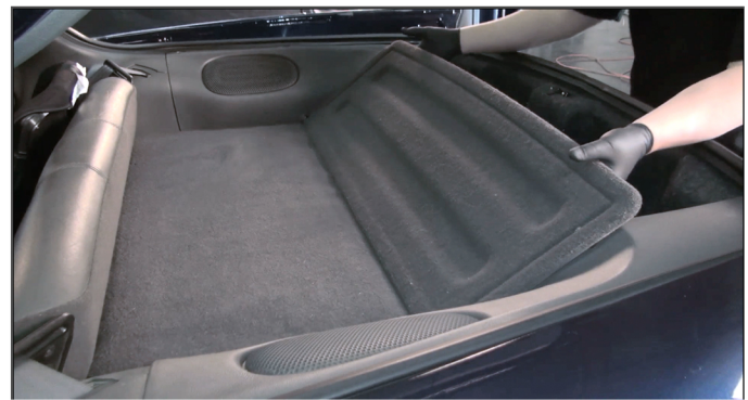
2) Remove the trunk separator panel.