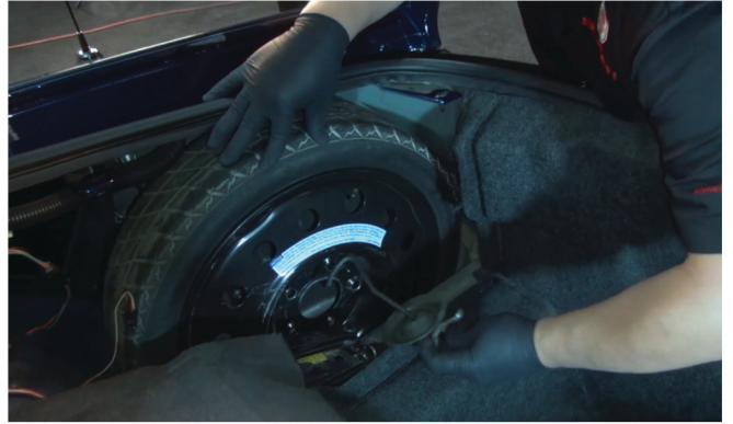
6) Remove the spare tire retainer hook, then remove the spare tire and set it aside.