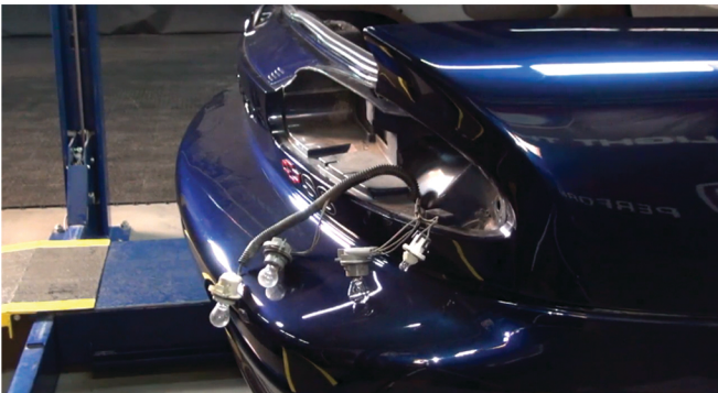
9) Remove the brake lamp, reverse lamp and turn signal sockets from the OEM tail light. Never touch exposed bulbs with bare hands.