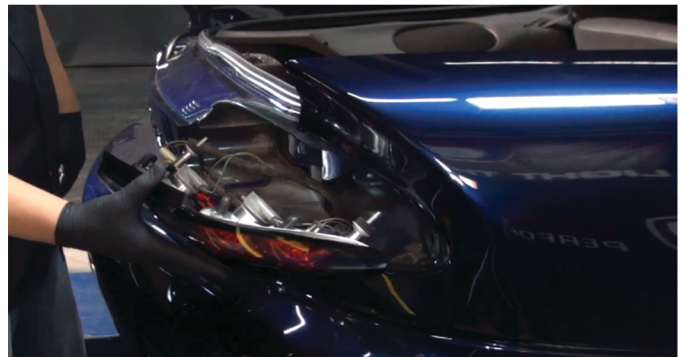
10) Install the brake lamp, reverse lamp and turn signal sockets into the Spyder tail light.