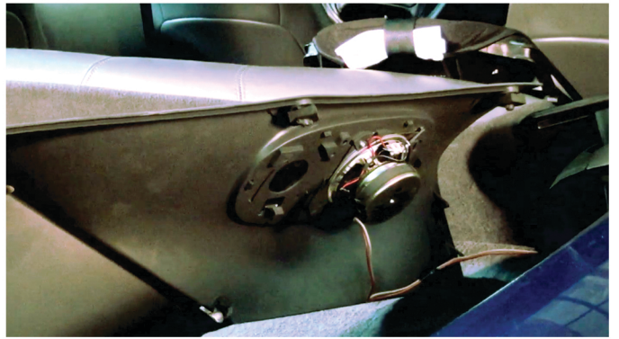
14) Reconnect the speaker harness for the spare tire cover panel.