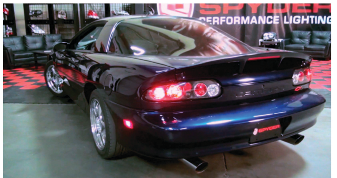
16) Close the hatch and enjoy your new Spyder Euro-style tail lights.