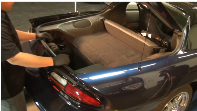
1) Open the hatch.

If you are unfamiliar with the installation processes, professional installation is highly recommended.