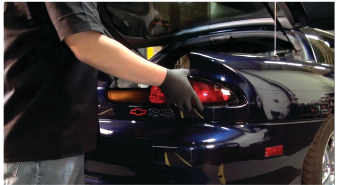
8) Unseat the tail light.