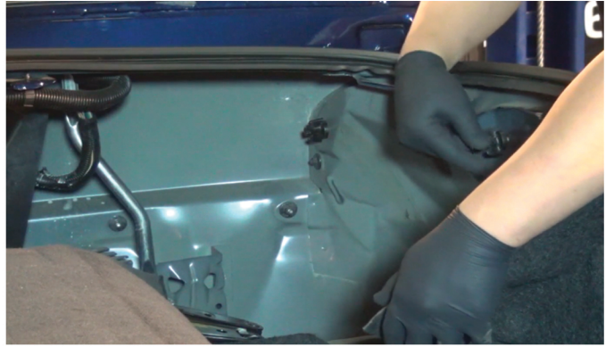
12) Reinstall [2x] thumbscrews to secure the tail light.