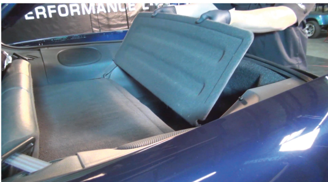
15) Seat the spare tire cover panel, then lock the three flathead retainers to secure the panel. Then reinstall the trunk separator panel.