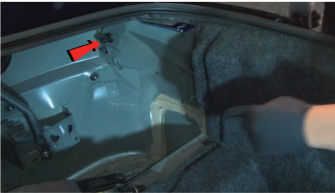
7) Remove the outer thumbscrew securing the tail light which was hidden by the spare tire.