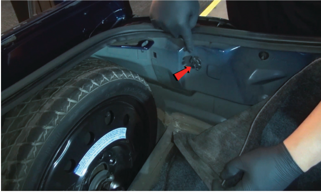
5) Peel back the trunk liner, then remove the inner thumbscrew securing the tail light.